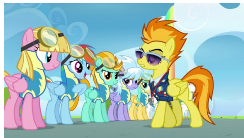
"The Wonderbolts Academy" episode.

Soon Twilight notices that Rainbow Dash multitasks and that she learns in her own way, while doing the things that she is good at, like flying. In the end, Rainbow Dash takes the test and scores an "A."