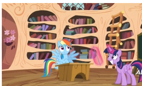
Twilight and Rainbow in the library in the "Testing, Testing 1,2,,3" episode.

The decision to leave her team is very hard for Rainbow Dash. She pretends that she is hurt because she cannot decide which team to be on. She later feels bad about lying and decides to rejoin her village's team. Her team wins and they get a gold medal. The Wonder Bolts give Rainbow Dash something special too, a Wonder Bolt Badge of Honor.